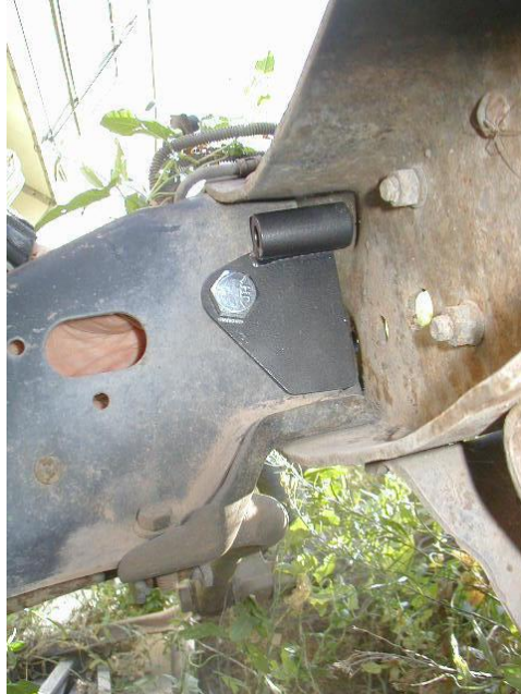
'73-'80 Bracket shown, the others are similar

The '67-'87 ('91) straight axle GM's are notorious for frame problems behind the steering box, even with stock height tires. Large tires and lockers only make the flex problems worse and flex eventually leads to cracks. This steering box brace goes to the source of the problem by stopping the flex before cracks can start.